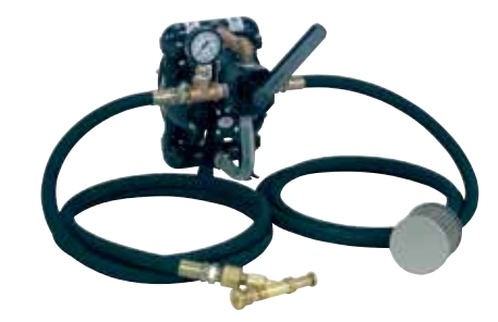
613201-2-C Calcium Chloride Tire-fill Pump Package

This 1:1 ratio pump has dual inlets to allow simultaneous pumping and blending of antifreeze and water.